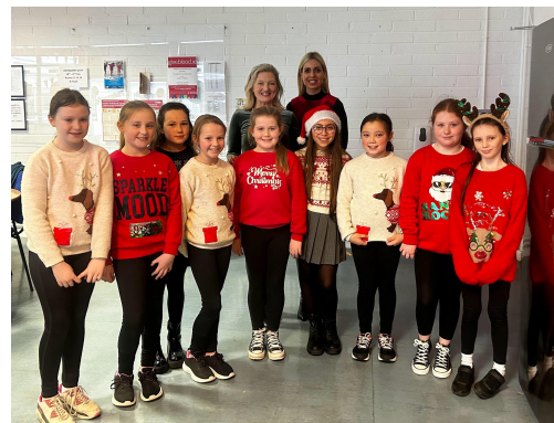
Some of the loyal WOW participants!

Remember green is cool at home and at school!