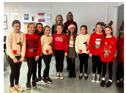
Some of the loyal WOW participants!