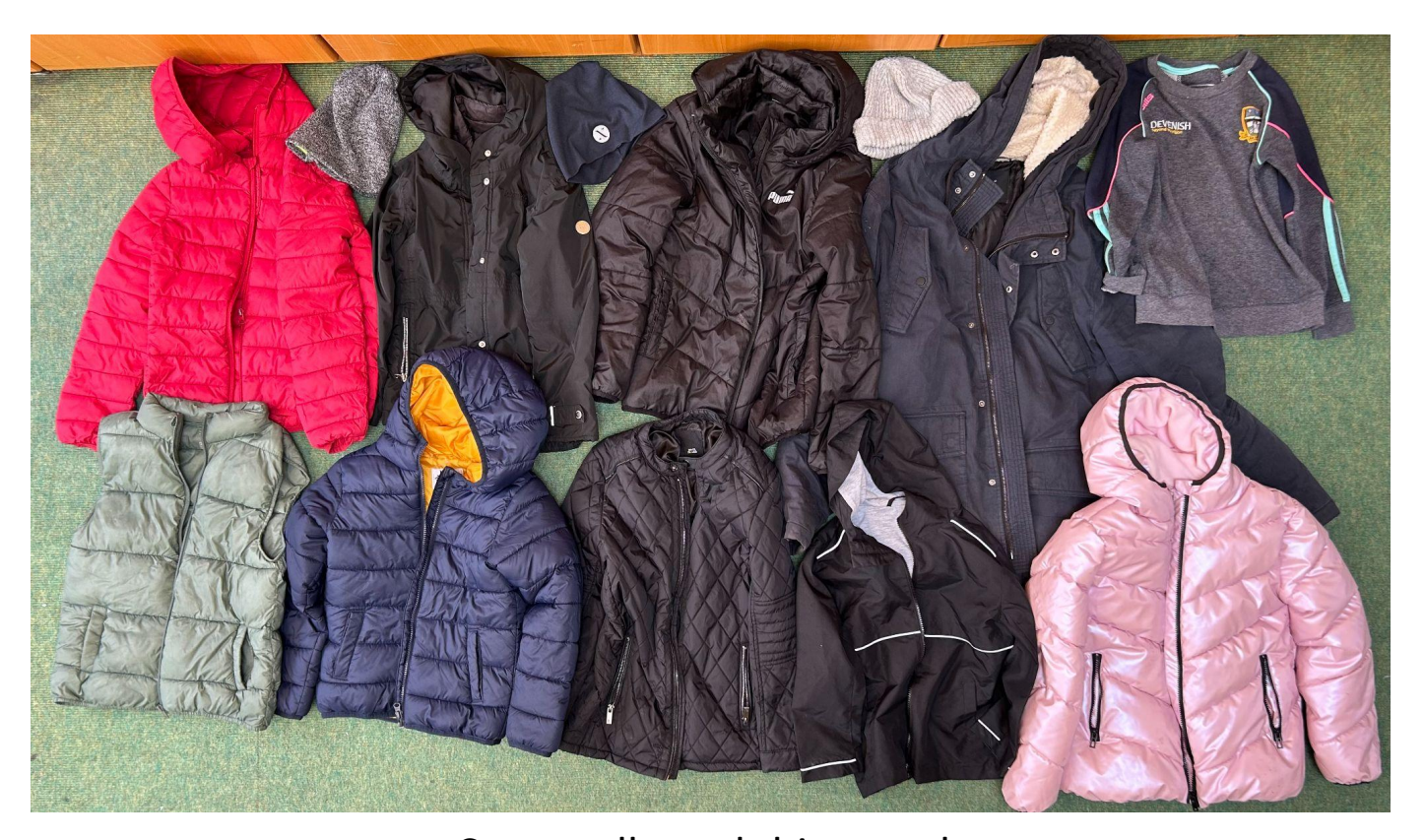
Coats collected this month. All uncollected coats will be donated by the end of the year. If your child is also missing their school jumper, we have a growing amount of uncollected school jumpers as well.