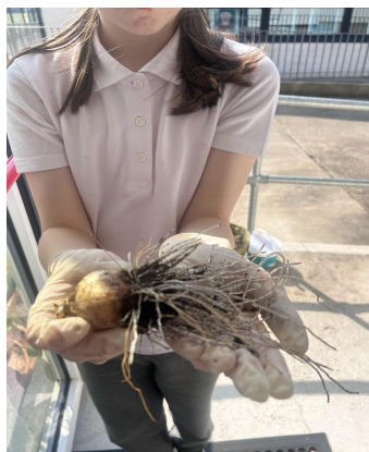
Clearing out the planting boxes and relocating bulbs!