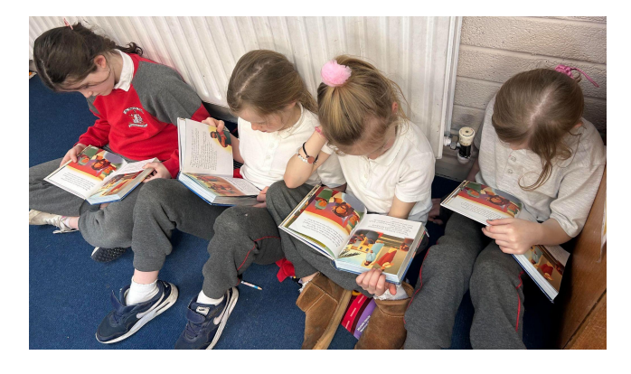
The girls in Second class reading their Bibles.

There will be an extra weekday Masses every Tuesday, Wednesday, and Thursdays during Lent at 7:45am